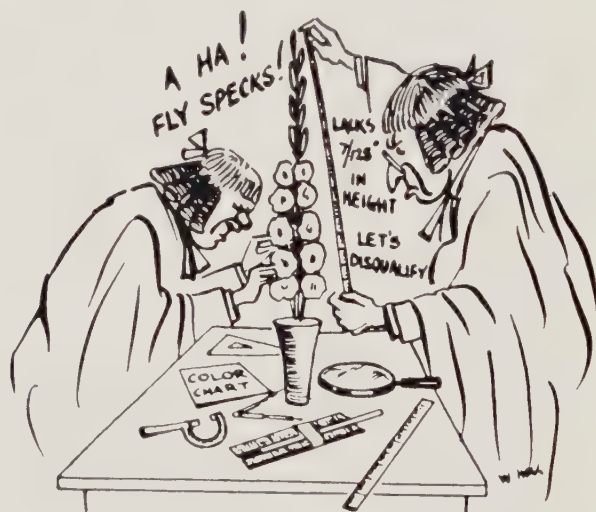
SHOW JUDGES AT WORK